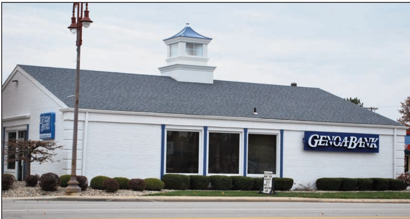
The GenoaBank branch in Maumee opened in 1999. Other branches are located in Perrysburg/Rossford, Millbury, Oregon, Port Clinton/Catawba Island and Sylvania. The bank’s corporate office is located in Genoa.

“I love the community, I love the customers. Everyone is so friendly here,” she said. “Maumee is growing and I feel that there is just so much opportunity to educate the community on what GenoaBank can provide. Honesty and integrity goes a long way because people need to trust you.”